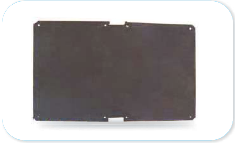
Bakelite Sheet Mounting Plate