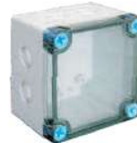
BASIC 0808 06T (With K.O.)