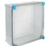
HEAVY 2828 13T