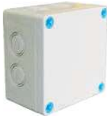
BASIC 1010 06G (With K.O.)