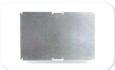
Galvanised Iron (GI) Mounting Plate

MATERIAL: Fiberglass Reinforced Polyester