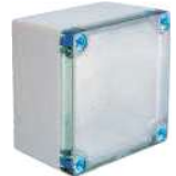
BASIC 1010 06T