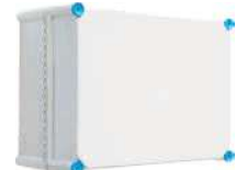
HEAVY 3828 17G