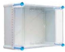
HEAVY 3828 17T