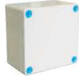
BASIC 1010 06G