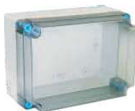
BASIC 1813 T