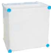
HEAVY 2828 17G