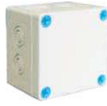
BASIC 0808 06G (With K.O.)