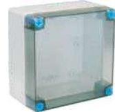
BASIC 1313 T