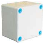
BASIC 0808 06G