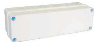
BASIC 2708 09G