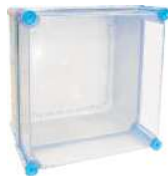
HEAVY 2828 17T