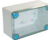
BASIC 1308 T