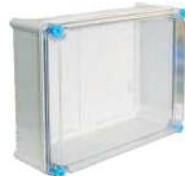
HEAVY 3828 13T