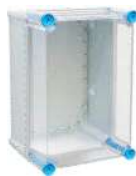
HEAVY 2819 17T