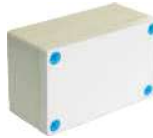
BASIC 1308 G