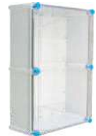
HEAVY 5638 18T