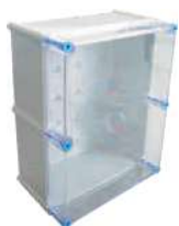
HEAVY 4538 21T