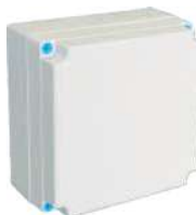
BASIC 1818 G