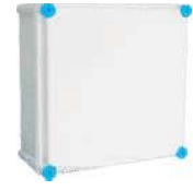
HEAVY 2828 13G