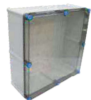
HEAVY 6060 22T