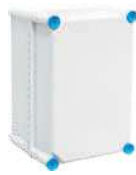
HEAVY 2819 17G