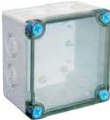
BASIC 1010 06T (With K.O.)