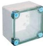
BASIC 0808 06T