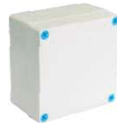
BASIC 1313 G