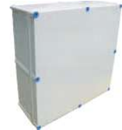
HEAVY 6060 22G