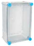
HEAVY 2819 13T