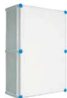
HEAVY 5638 18G