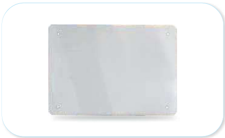
FRP Mounting Plate

MATERIAL: Fiberglass Reinforced Polyester