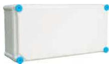
HEAVY 3819 13G