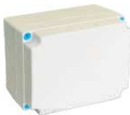
BASIC 1813 G