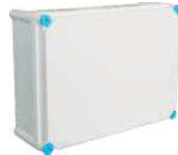
HEAVY 3828 13G