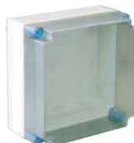
BASIC 1818 T